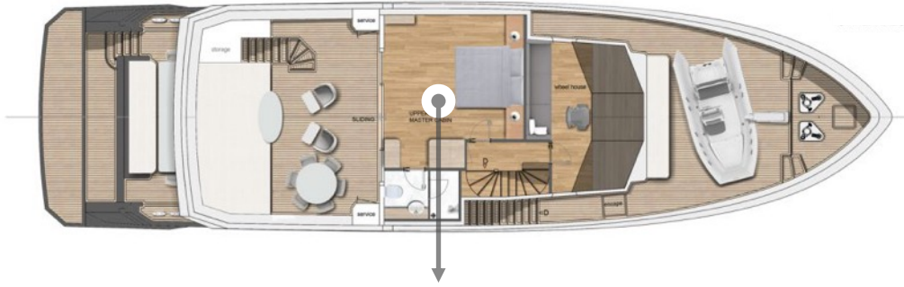
UPPER DECK MASTER CABIN